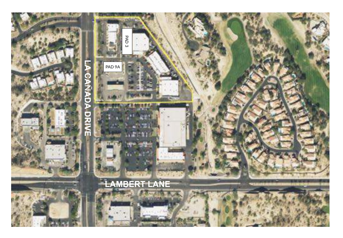
21,640 La Cañada, 12,534 Lambert: 34,174